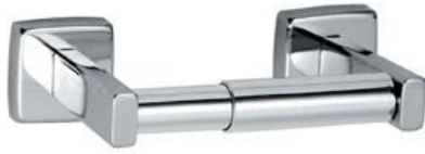
AI0113C Bright finish