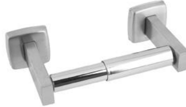
AI0113CS Satin finish